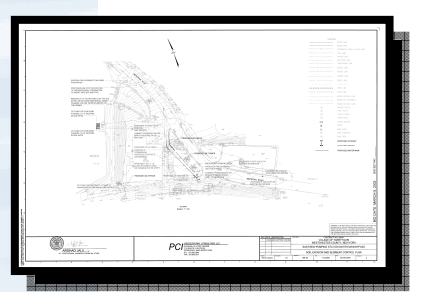
PCI Professional Consulting, Inc.